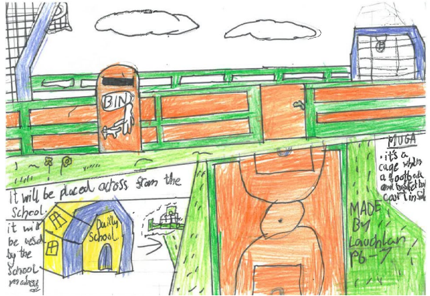
Dailly in the future: artwork by Lauchlan Barr, Dailly Primary School P6

The aim of the Community Action Plan is to identify priorities for people in Dailly, to shape investment of our Hadyard Hill funds and enable local partners to develop projects that address short, medium and long-term needs of local people. This Community Action Plan was commissioned by Dailly Community Council.